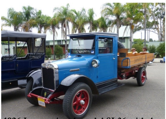
1926 International model SL36 with 4 cylinder Lycoming engine

What a difference a day makes. After the record-breaking 46 degrees of the day before, Saturday 19th was overcast, warm but pleasant. For a first time show it was small but well set out. There was a handful of vintage trucks including a rare 1926 International, cars, speed-cars and stalls with the usual bits and pieces for sale. Inside the show ring there were numerous stationery engines on display with some running. Six of our members were there to represent the WSHTC.